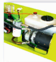
Easy for Maintenance