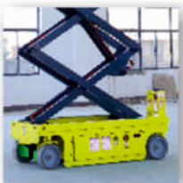
Automatic Pothole Protection